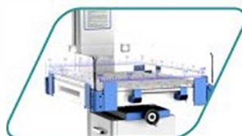
Big infant bed