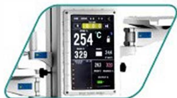
LCD Touch screen

With RS-232 connector ,2 tray and 2 drawers