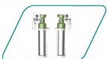
Oxygen supply system