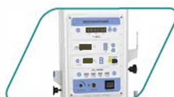
Air temp&count down timer