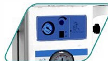
Low Pressure Aspirator