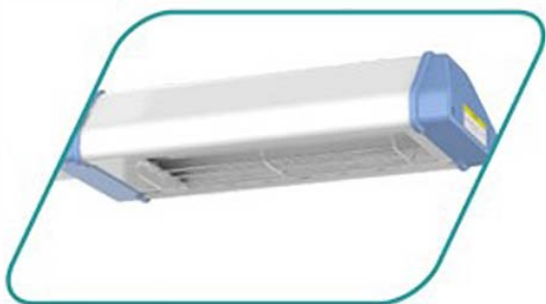
Heating head with metal grid