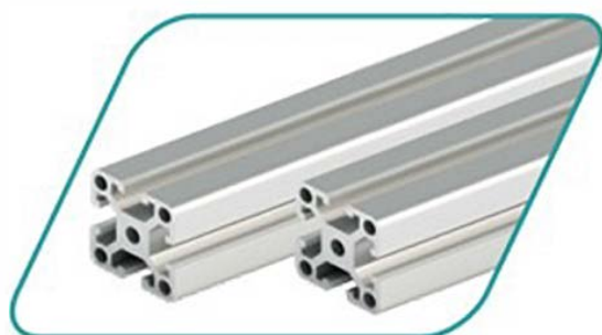
Aluminium alloy material